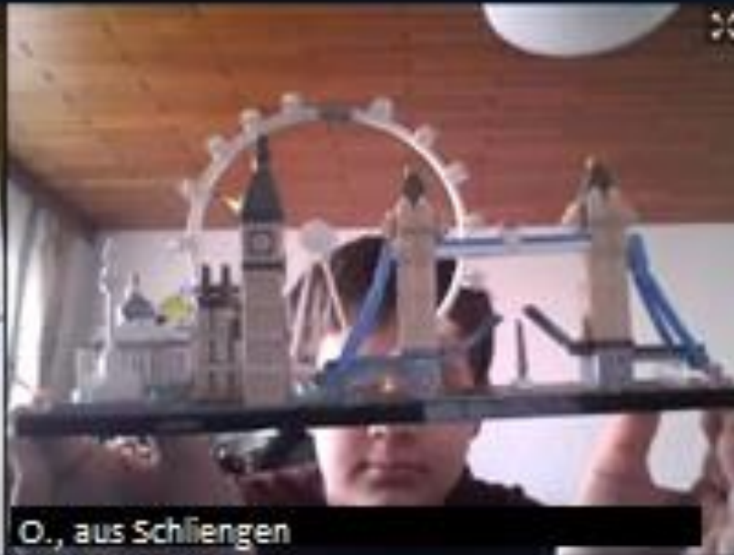
O., aus Schliengen