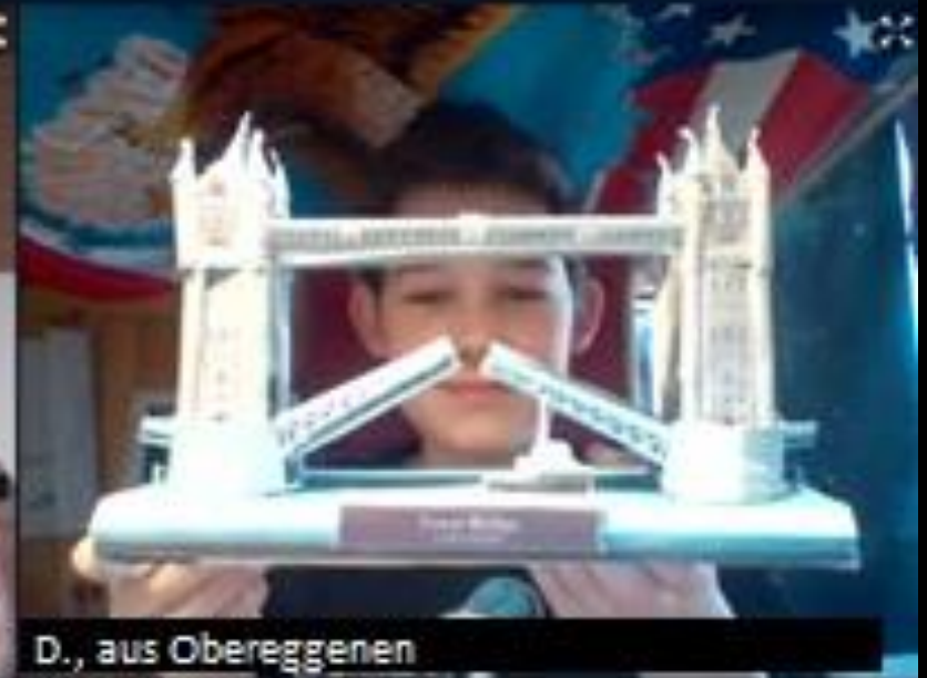
D., aus Obereggenen