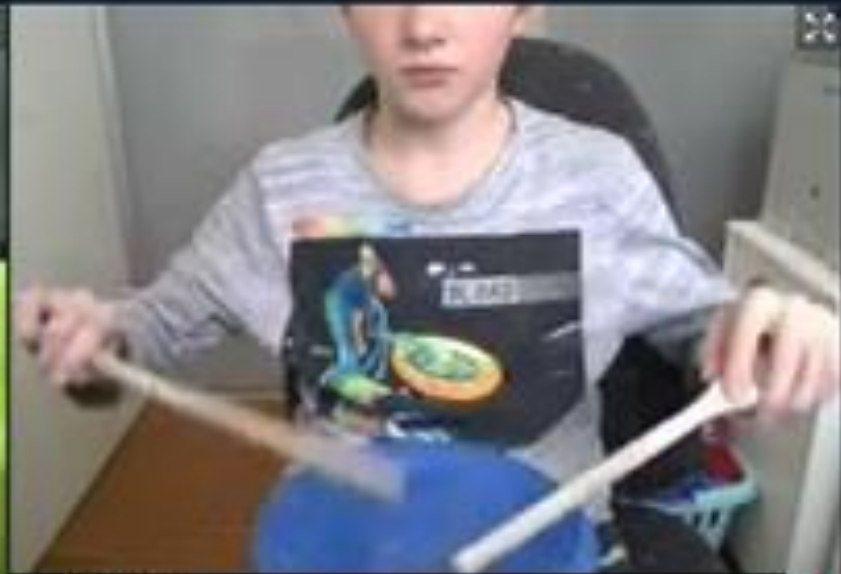
L., aus Uel