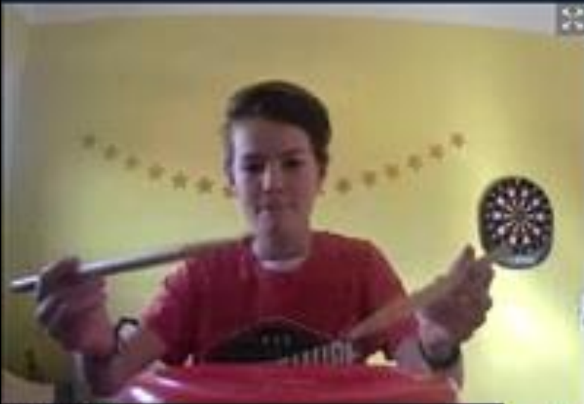
L., aus Uel